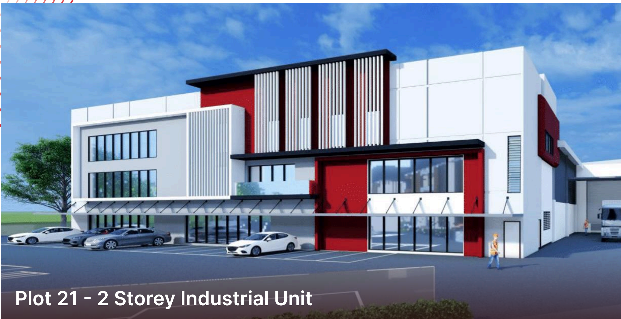
Plot 21 - 2 Storey Industrial Unit