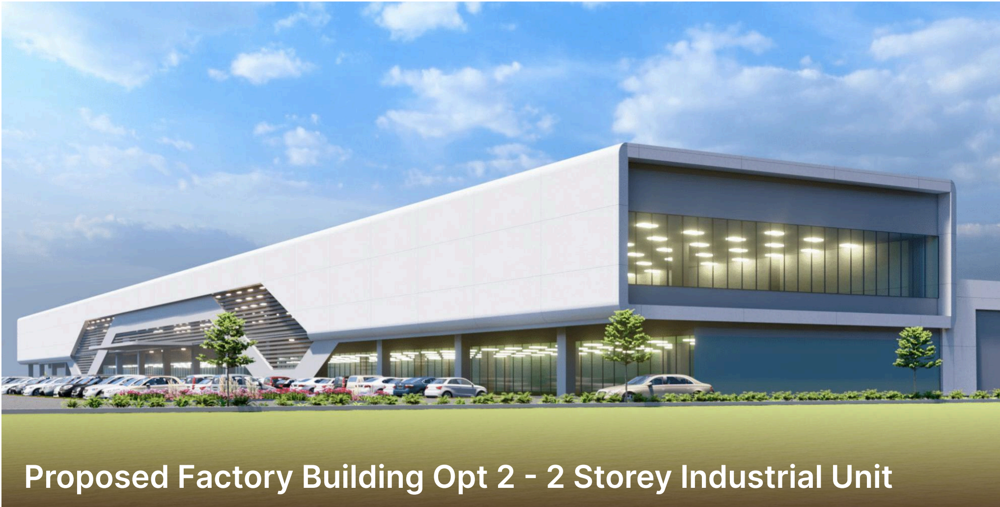
Proposed Factory Building Opt 2 - 2 Storey Industrial Unit